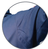
UNDERARM GUSSET EXPANSION