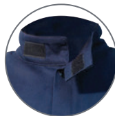
RAISED-BACK, STAND UP ADJUSTABLE COLLAR